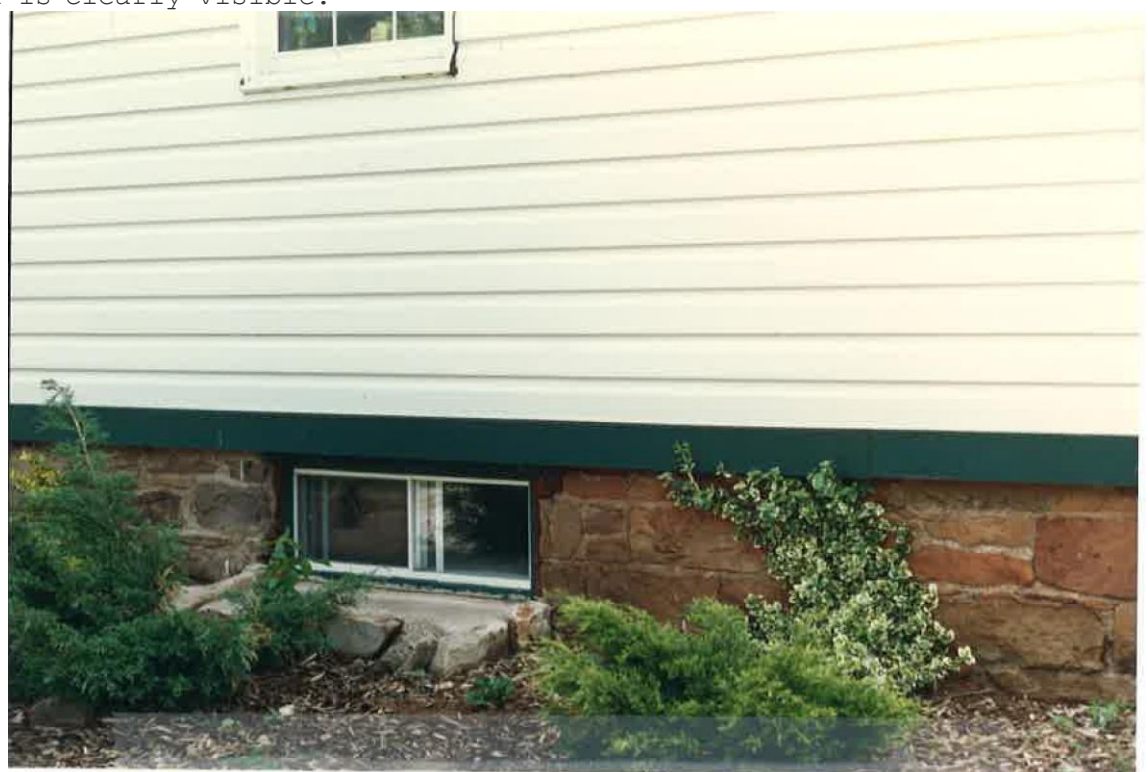
3.0 THE BARN