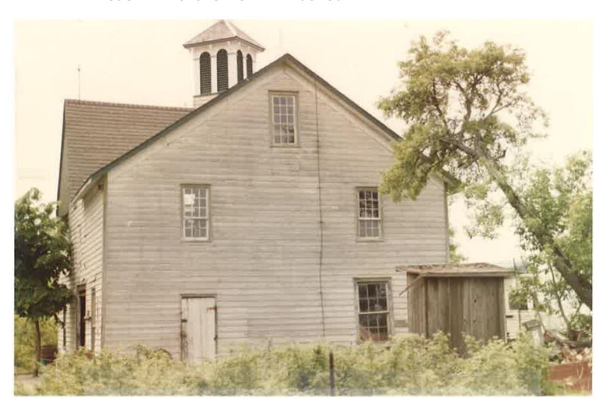
4.0 THE CARRIAGE HOUSE

The barn at the Bowslaugh house is of Dutch Style, characterized by continuous access from the front to the back. It has a gabled roof with an off grain cupola (according to the author of "Niagara Fruit Barns" this signifies the owner was Pro-Confederate) and a pediment to the left of the main door. On the South facade there are three double hung sash nine over six windows and a vertical hinged door. The main barn door is two leafed. The East facade consists of four windows, all double hung sashed with nine panes over six. This facade also sports a vertical hinged door. The North facade consists of a vertical hinged door, a two leafed door and a hole for the horses to stick their heads out of. The west side consists of three double hung sash nine over six windows.