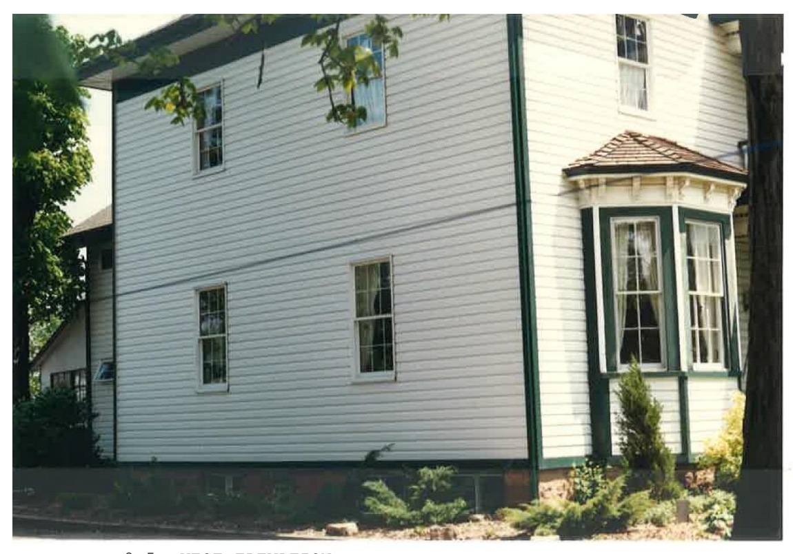
2.5 WEST ELEVATION

This busy facade consist of a shed roof, a wing with a gabled roof, a dormer and a truncated hip roof. The back structure consists of two double hung sash six across six windows and a screen door. The North wing has two single ten pane windows, and the widows-walk has five windowsone over one and one single paned door. The dormer is adorned with three casement windows each consist of six panes. The main body of the house is characterized by a casement window of six panes, and a six across six firstfloor window.