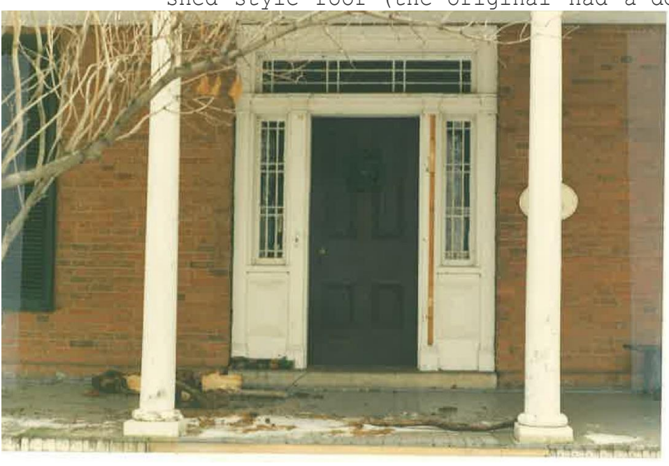
Detail of front entrance

The front west elevation is symmetrical in shape with a three bay Flemish Bond facade. The double hung sash windows contain 12 panes and are covered by storm windows and are trimmed with flat arch brick work overhead and black louvered shutters on the sides. The main entrance is composed of a four panel single door, with a rectangular transom and side lights framed by paneled pilasters. A one tier, 5 bay, verandah covers the entranceway with a shed style roof (the original had a deck).