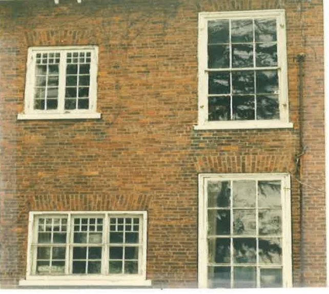
Details of windows

The south elevation is laid in Common Bond displaying five differently styled windows. The upper left window is of a double casement design with eight small panes over eight larger pains. The lower left window is square in shape withthree double hung sash windows each 10 panes over 4. The upper right is rectangular shaped with double hung sash (6 over 6) as is the lower right. Below this is a small window for the basement. They all have a flat arch ofradiating voussoirs.