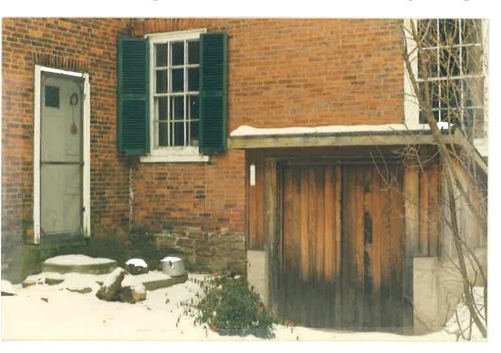
Detail of rear elevation

The rear (east) elevation, half concealed by an addition, also displays a Common Bond facade with a variety of window styles. There are three rectangular double hung sash windows, 6 over 6. One, with louvered shutters, was originally the rear doorway. There is also a wooden cellar entrance with a cement foundation. This appears to be a replacement for what was originally a bulkhead type entrance.