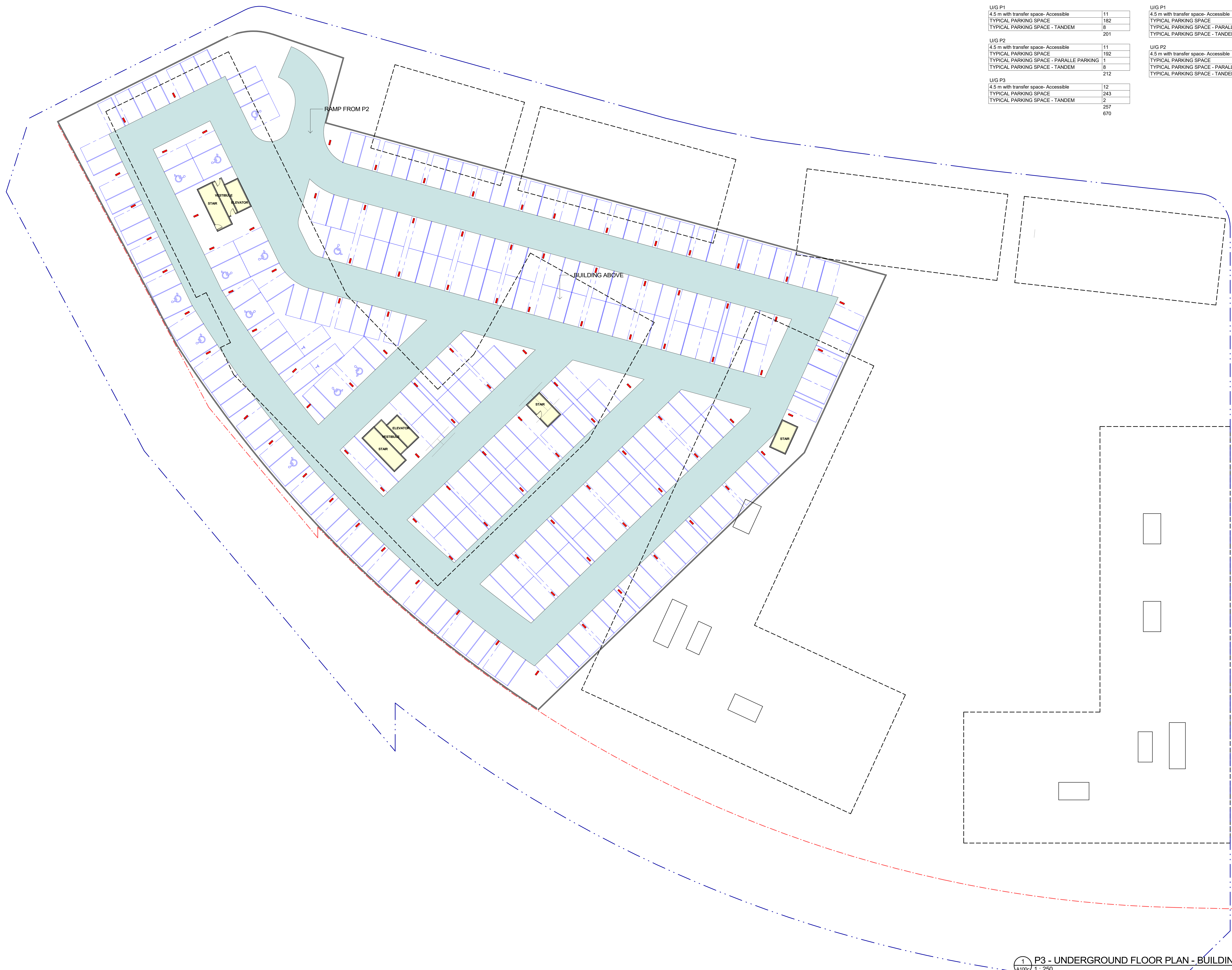
1 P3 - UNDERGROUND FLOOR PLAN - BUILDING A, B, C & D A100c 1 : 250

C:\Users\cmc\Documents\118004_300\Wpd - New 300 Plan - Rev 2019 - 06-11 - Client - Local\chamberlainpd.com\my