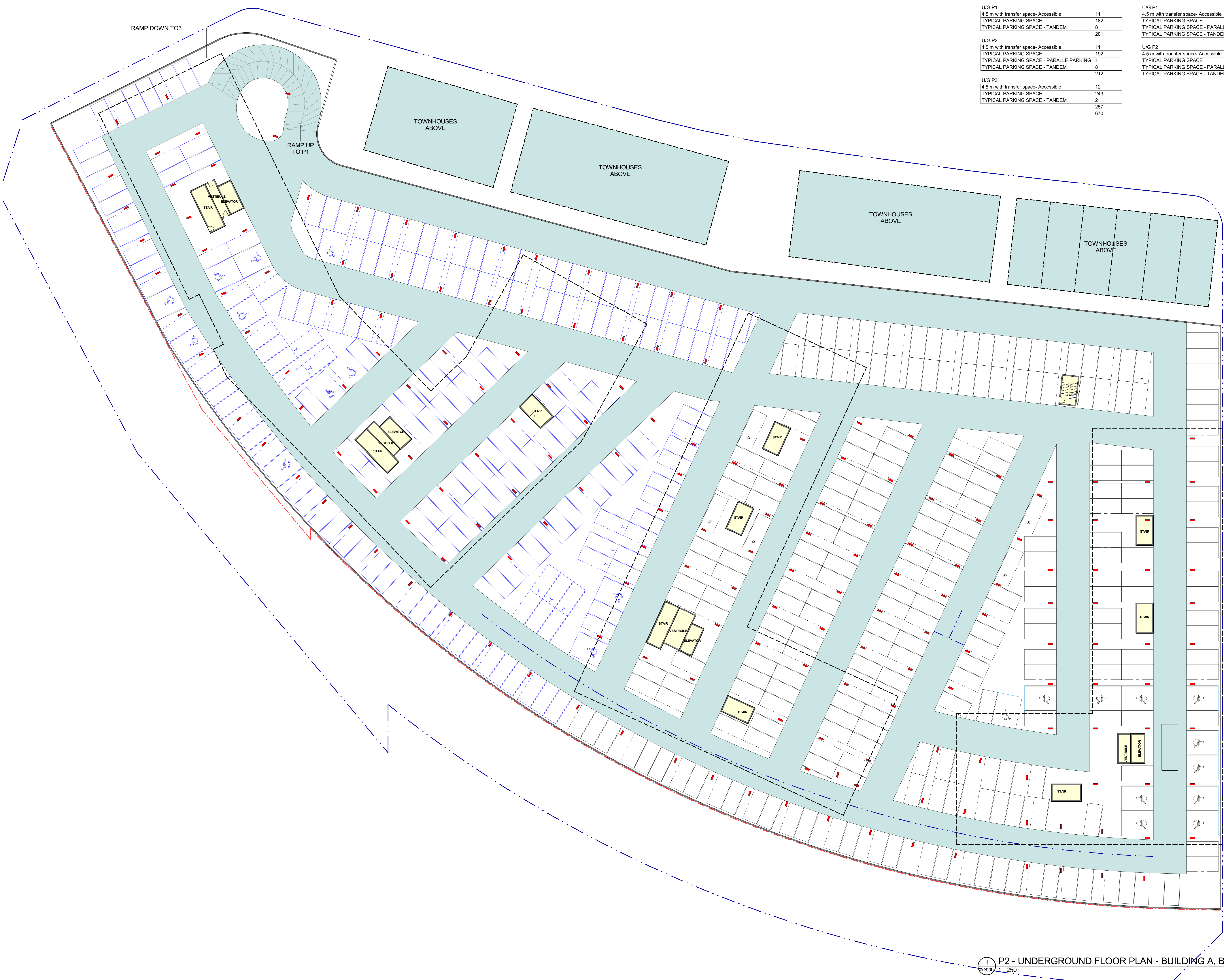
P2 - UNDERGROUND FLOOR PLAN - BUILDING A, B, C & D SCALE 1 : 250

C:\Users\cmc\Documents\118004_001.dwg - New 250 Plot - Rev 2019 - 06-11 - Current Location: chamberlainpd.com